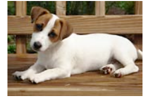
All about your pets.